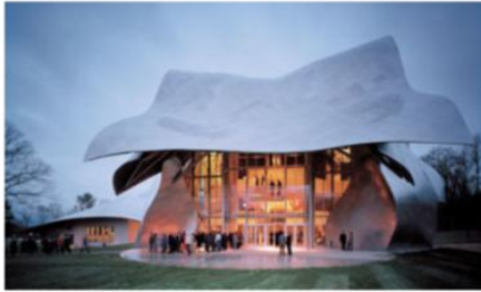
Bard College Avon-on-Hudson, New York December 2009