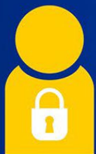
Data Protection Officer (DPO)