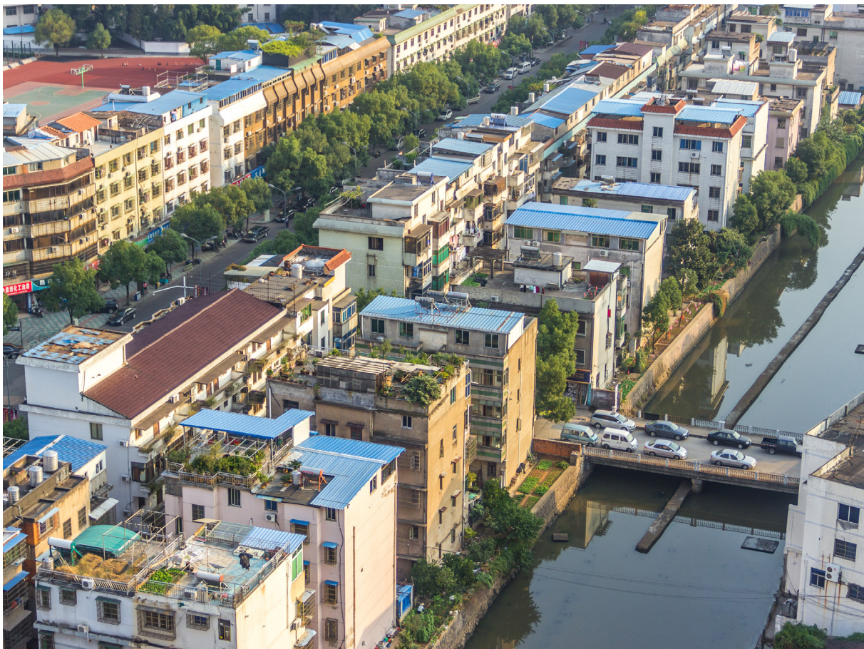
City of Yiwu, Zhejiang, China.