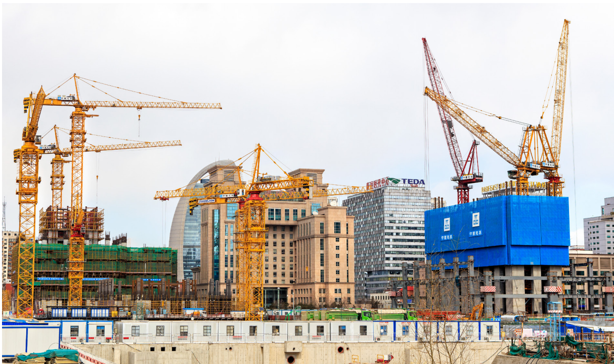
On-going construction are seen around Beijing Central Business District (CBD).

Financial agency: investment and financial management, business model design.