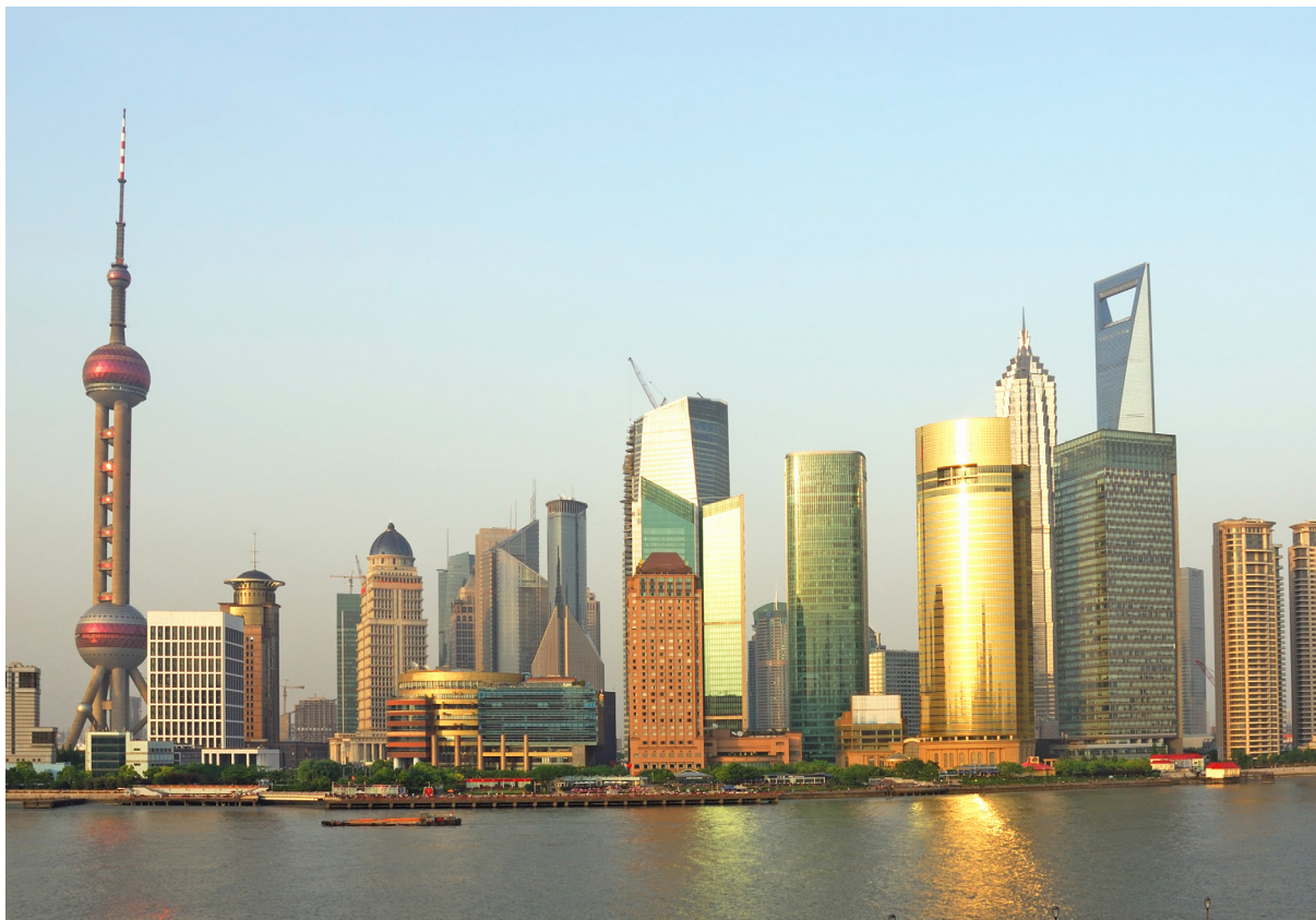
China Shanghai the pearl tower and Pudong skyline at sunset.

In the case of the first PCN, describing the promotion of passive houses, it is estimated that completely adopting passive houses in new buildings by 2030 would reduce energy use by 343 million tce annually (total floor area of new buildings: 30 billion m 2 in the whole of China), with a requirement for an additional investment of 17.88 trillion RMB. In the case of the second PCN, to promote air source heat pumps (ASHPs), it is estimated that completely adopting ASHP technologies would reduce energy use by 60-90 million tce, with a total investment of 1.0-1.2 trillion RMB (6 billion m 2 of existing buildings in the Yangtze River region). Despite the high upfront incremental investment, the potential net present value (NPV) of energy savings during the buildings' use life would exceed the costs set out in both PCNs.