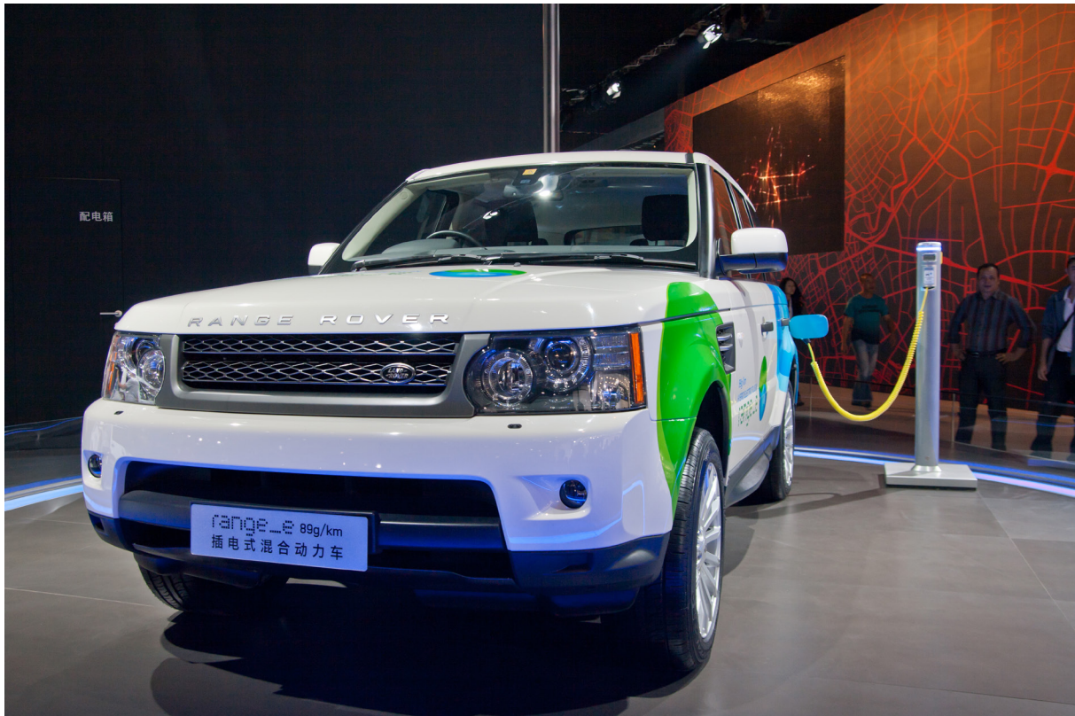
An electric vehicle on display at the 9th China International Automobile Exhibition, on November 25, 2011 in Guangzhou, China.