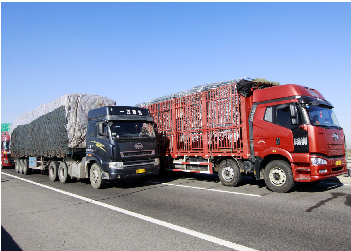
Heavy duty trucks stopped on the highway because of the traffic jam, on December 9, 2013, Tianjin, China.

More than 90% of total HCV fuel consumption comes from trucks, i.e. heavy cargo vehicles. In order to promote energy conversion in China's transportation sector, reduce fuel consumption and guarantee energy security, the fuel economy of trucks must be regulated from the side of production so as to continuously increase the efficiency level of vehicles during the actual operation process from the source.