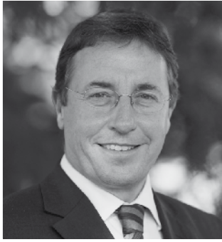
Achim Steiner

“If targets for greenhouse gas (GHG) emissions reduction are to be met, decision-makers must unlock the potential of the building sector with much greater seriousness and vigor than they have to date and make mitigation of building-related emissions a cornerstone of every national climate change strategy. Together, we must raise awareness of the important role of this sector as a priority in meeting national GHG emission reduction targets. We must form national and regional baselines for building-related emissions using a consistent international approach, such as the Common Carbon Metric to measure, report, and verify performance.