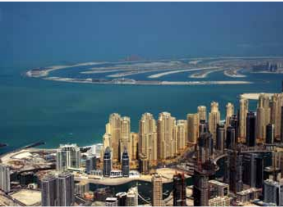
UAE Dubai Marina and Palm. Credit: www.istockphoto.com

The plentiful sunshine means an abundance of solar power but also a high demand for electricity for air conditioning. Credit: www.istockphoto.com