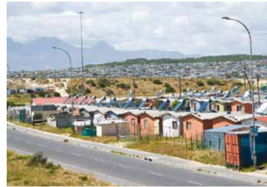
The Kuyasa CDM project entailed the retrofitting of 2,300 homes with solar water heaters, insulation and energy efficient light bulbs.

The community was involved throughout the design and construction process, and all construction workers received training, which was designed such that workers would learn both specific skills and a general problem-solving approach which would be transferable. Components of the building were designed so that they could be supplied by local small enterprises: brick recycling, door and window manufacture, burglar bars, reed ceilings and landscaping were "outsourced" to local enterprises. Material suppliers were assessed for compliance with fair labour practice and support for 'historically disadvantaged' individuals (ie individuals who were discriminated against under the 'apartheid' regime). Technology used was appropriate to the skills level of the community.