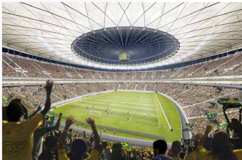
The new National Stadium in Brasilia is currently seeking LEED certification. Credit: Castro Mello Architects