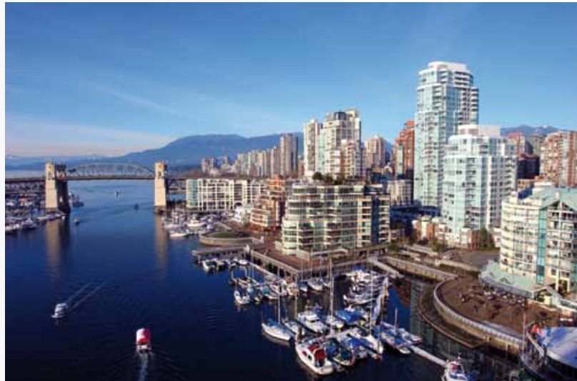
Vancouver Harbor.

While supporting an important social cause, the building also demonstrates excellent environmental performance including a storm water management plan, close proximity to public transportation, and use of locally-sourced and recycled building materials, among other features. In addition, the building was designed such that 90% of the spaces have views to the exterior. The CMHA even initiated a green building education policy with the purpose of educating the residents and visitors of Haven Gardens about the buildings key features and many benefits. 7