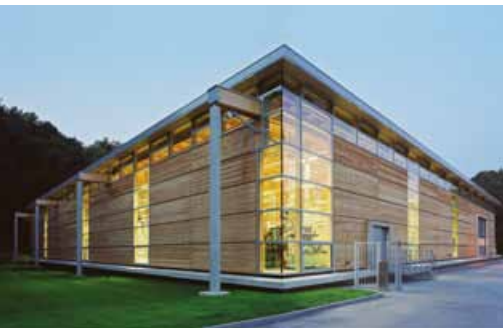
Sahna Industrial Building, DGNB Gold, Großharthau - Schmiedefeld.

Many of the social and economic priorities in Germany are closely linked to the environment, such as improving energy security and resource efficiency. Germany is seen as one of the environmental leaders in Europe and key goals include strengthening water infrastructure, improving waste management, phasing out nuclear energy, encouraging the use of renewables and discouraging the use of environmentally harmful construction materials.