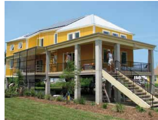
One of many homes being built by Make It Right New Orleans, the post-Hurricane Katrina housing initiative.

After Katrina hit New Orleans in 2005, USGBC organized a charrette on Gulf Coast Reconstruction which resulted in The New Orleans Principles – a consensus-based document that identified specific strategies for a sustainable rebuilding effort. The principles represented a consensus among the 160 participants, including residents of New Orleans, along with experts in urban planning, waste and water management, engineering, and architecture. One of the central themes of the Principles was inclusivity; recognizing that local community involvement and investment is at the core of any effort to build or rebuild a city.