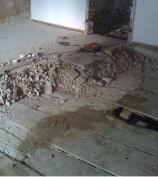
Demolished partition walls left and used as a substrate