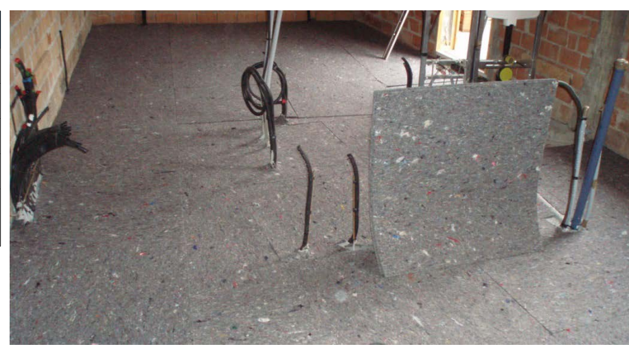
Photovoltaic system - TNT underflooring above systems