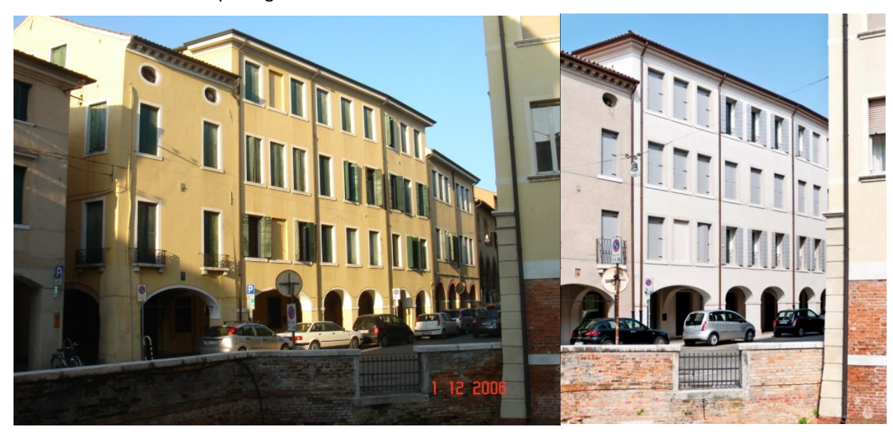
General view of the building before and after the intervention