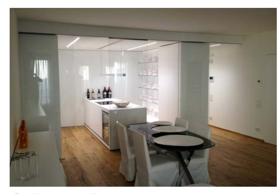
Typical living room in a dwelling