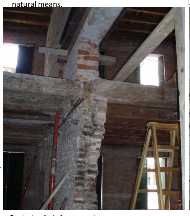
Crooked walls, before renovation

The domestic hot water was supplied by electric heaters with storage tank; there wasn't a ventilation system, so ventilation was made by