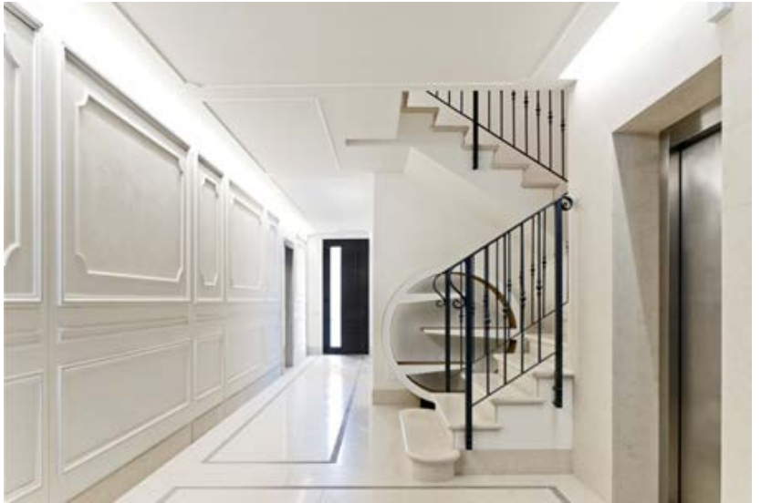
Main entrance to the building from via Riccati