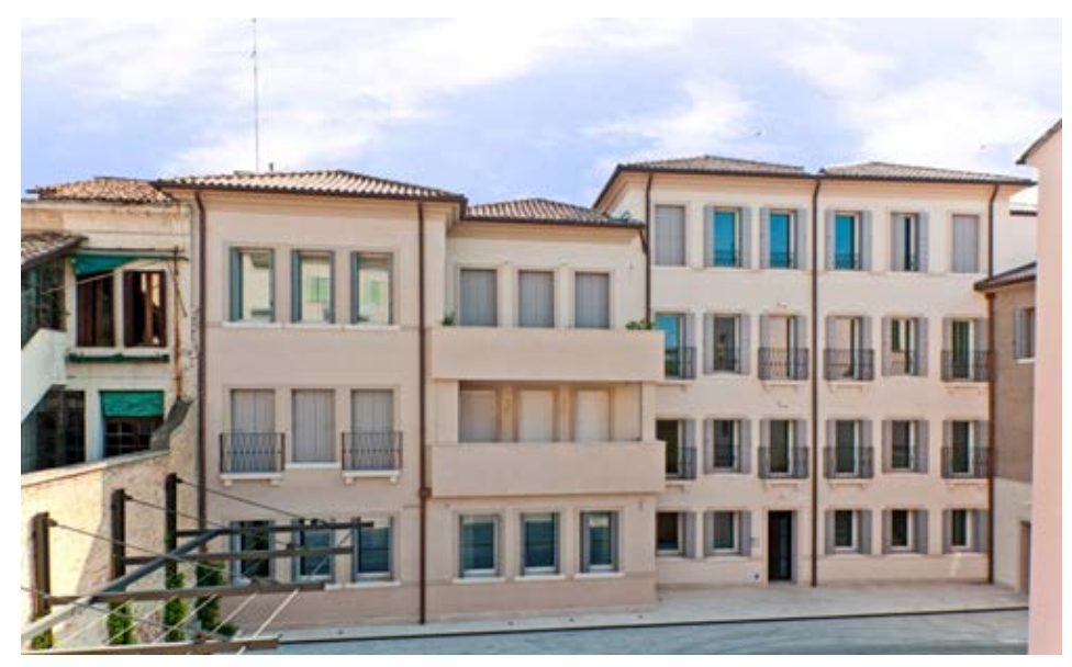
Courtyard from west perspective

A prestigious location, a renovated historic building with the most innovative technical solutions made a safe and long-lasting investment.