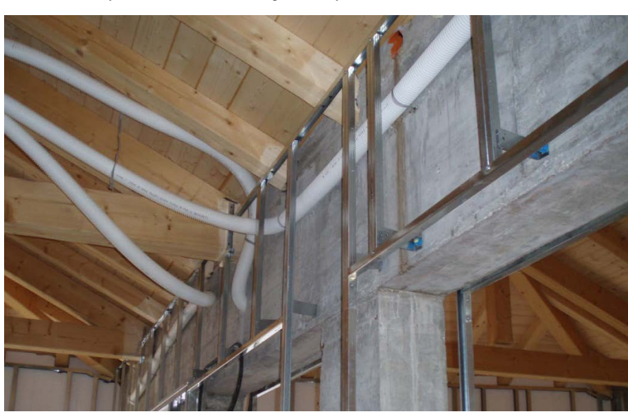
Mechanical ventilation system